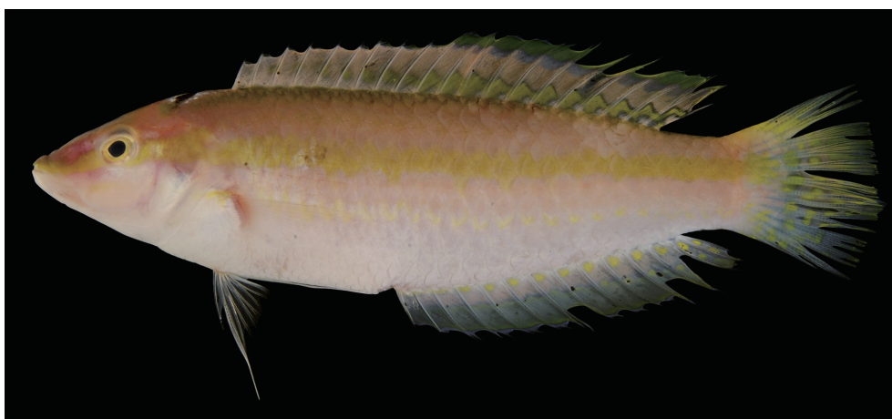
Fig. 2. Fresh specimen of Leptojulis lambdastigma . KAUM-I. 17035, male, 101.6 mm SL, obtained at Pulau Kambing Port in Kuala Terengganu, Terengganu, Malaysia.