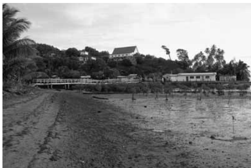
Fig. 5. Rehabilitated mangroves in Malawai Village.

The production of new commodities such as the coconut furniture and products can provide excellent opportunities in the Pacific Islands. More attention should be devoted to new technology that will enhance the health of the environment. Compost toilets, smokeless stoves and fish aggregation devices are all examples of technology that can reduce human impact on the island environment. Other technologies such as the use of renewable energy and the management of waste can ensure the maintenance of the health of the environment that will in turn protect and provide for communities.