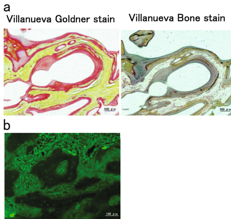
Figure 2 Pathological examinations. a: Mineralized bone tissues are colored in green and nonmineralized osteoid tissues are shown in orange by Villanueva-Goldner stain. Mineralized bone tissues are colored in purple and nonmineralized osteoid tissues are shown in the clear zone by Villanueva bone stain. The osteoids volume/mineralized bone volume ratio was 20.7% (normal range, less than 10%). Osteoid thickness was 25.1 \mu\text{m} (average, less than 12.5 \mu\text{m} ). b: Tetracycline labeling examination showed no double-labeling pattern. These findings indicate mineralization deficiency and osteomalacia.

Adefovir dipivoxil is a commonly used antiviral agent in the treatment of chronic hepatitis B or HIV infection [9]. Fanconi's syndrome has been recognized as a