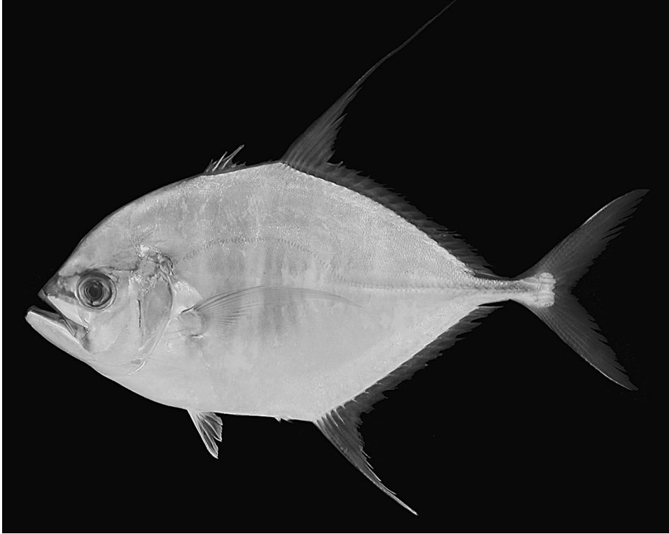
Fig. 3. Ulua mentalis (Cuvier, 1833), KAUM-I. 1120, 187.5 mm SL, Kasasa, Kagoshima, Japan.

ments, as percentages of FL, are given in Table 2.