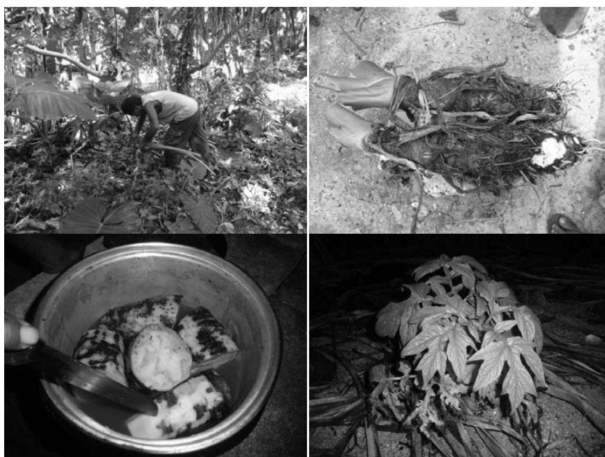
Fig. 2. Alocasia macrorrhizos (upper left, upper right, lower left) and Tacca leontopetaloides (lower right) in Piis-Paneu Island.