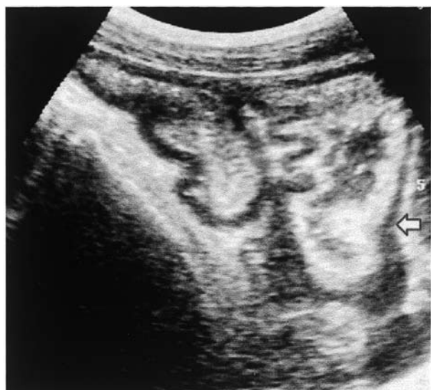
Fig. 2. Abdominal sonography indicated wall thickness of the bowel (arrow), as in the findings of the CT.