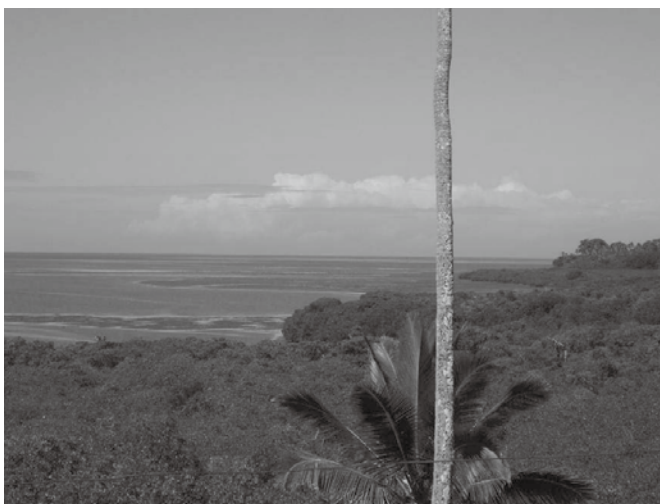
Fig. 1. The coastal area, coexisting mangrove forest, tidal flat, and coral reef on the Viti Lavu Island in Fiji.