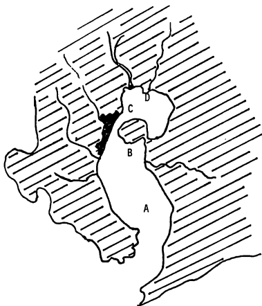
Fig. 1. Sampling stations in the Kinko bay.

A is off shore 300 m from Ibusuki B is near ferry boat harbour of Sakurazima C is at Ryugamizu near the cage of yellow tail farm D is the innermost bay