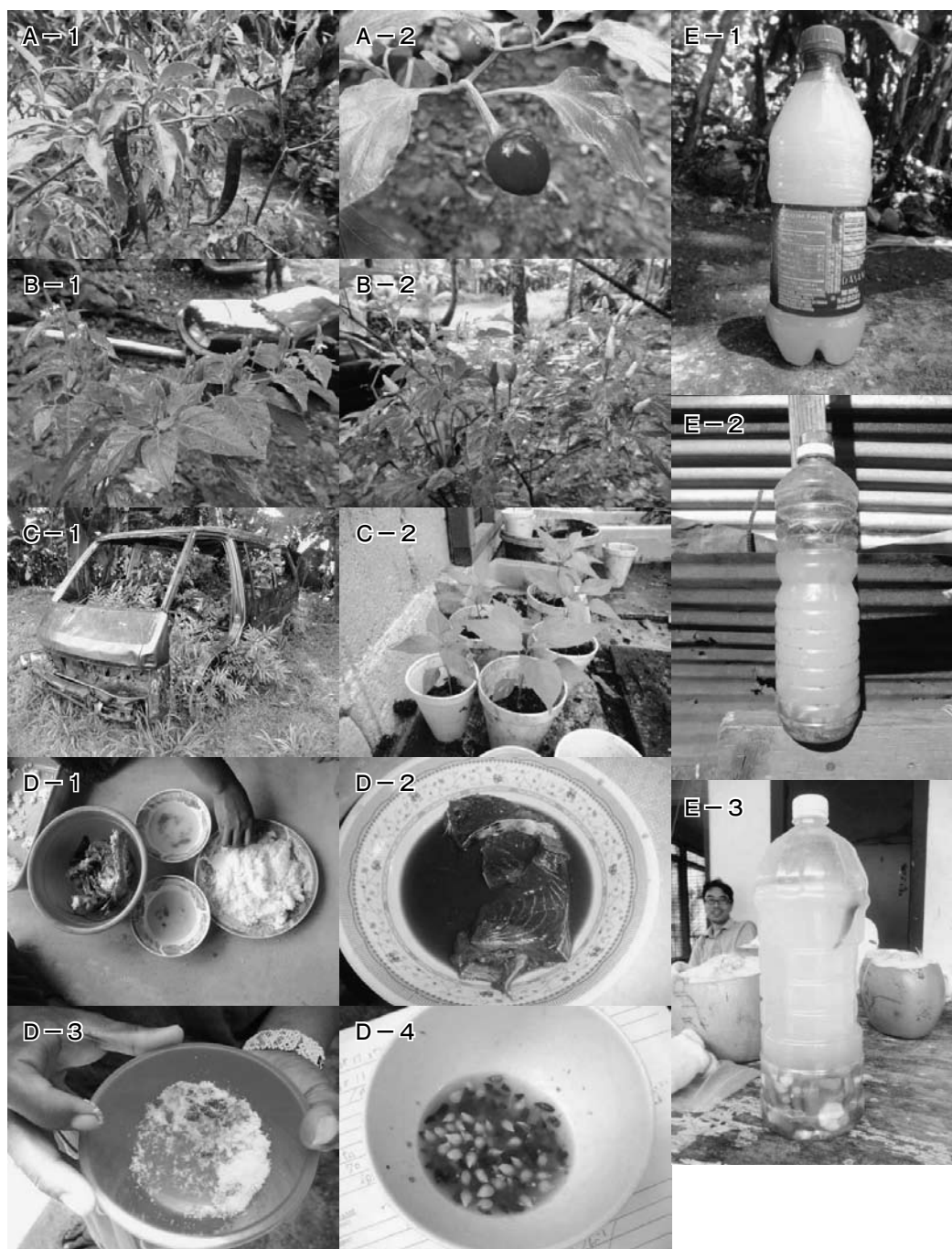
Fig. 2 Use of Capsicum peppers on Weno, Romanum, and Piis islands, Chuuk Atoll.

A long fruit (A-1) and a round fruit (A-2) cultivar of C. annuum . A green immature fruit color type (B-1) and a greenish-yellow type (B-2) of C. frutescens . A weed plant of C. frutescens found growing in an abandoned car (C-1) and seedlings of C. frutescens in a small cup (C-2). "Setifat" on Weno and "unuken" on Romanum (water, salt, and fruits of C. frutescens ) (D-1), raw fish mixed with a sauce made of C. frutescens , soy sauce, and lime juice (D-2), and using the peppers as a stimulant (D-3: C. frutescens and salt; D-4: C. frutescens , salt, and lime juice). Water of mature coconuts placed in the sun for fermentation (E-1) and C. frutescens fruits soaked in such water, occasionally with garlic, also placed in the sun (E-2 and E-3).