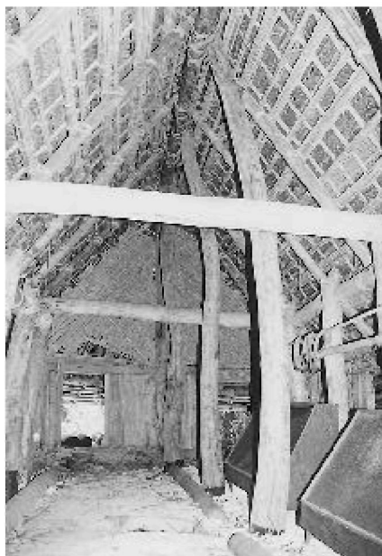
Fig. 2. Interior view of rural house, Bechiel Village: the core column is set in the center.