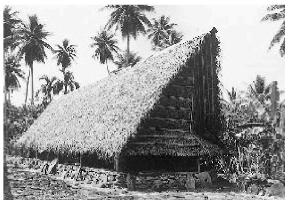
Fig. 1. Exterior view of rural house: Bechiel Village.