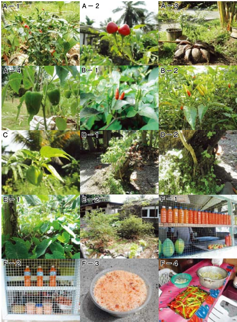
Fig. 2. Use of Capsicum peppers on Kosrae Island.

Cultivars of C. annuum (A-1: erect fruit, A-2: round fruit, A-3: pendent long fruit, and A-4: bell pepper). A green immature fruit color type (B-1) and a greenish-yellow fruit color type (B-2) of C. frutescens . A flower and fruit of C. chinense (C). A weed plant of C. frutescens found growing on a dead stump (D-1&D-2). Plants of Capsicum grown in a field of taro ( Colocasia esculenta ) (E-1) and in a home garden (E-2). Hot sauces (F-1) and salted fruits of Capsicum (F-2&F-3) made on Kosrae Island sold in small shops. Materials for hot sauces (F-4).