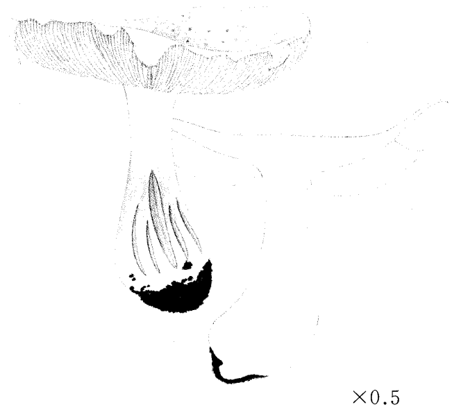
2. Amanita gymnopus