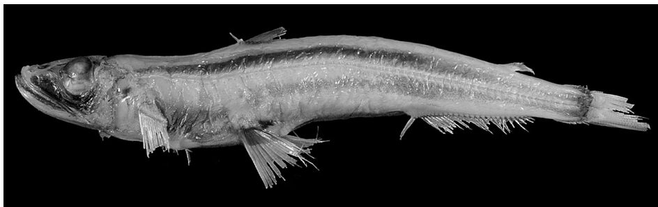
Fig. 1. Scopelarchoides krefftii Johnson, 1972, CSIRO H 2710-01, 190.2mm SL, Pedra Branca Seamount, off Tasmania, Australia.

147°14'E, 820 m depth, orange roughy trawl, D. Whennan, FRV Barameda , 5 September 1992.