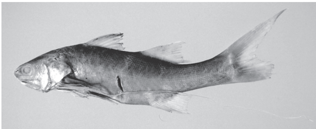
Fig. 1. Lectotype of Polynemus macrophthalmus Bleeker, 1858, RMNH 6015, 129 mm SL, Palembang, Musi River, Sumatra, Indonesia

The osteological characters were confirmed from X-ray photos taken of all specimens. The swimbladder was confirmed from MNHN 1891-571, ZMA 114.431 (215 mm SL, 1 of 3 specimens) and ZMA 114.432, abdomens of these being already dissected. Institutional codes follow Leviton et al. (1985), with an additional institutional abbreviation as follows: Division of Fisheries Sciences, Miyazaki University, Japan (MUFS).