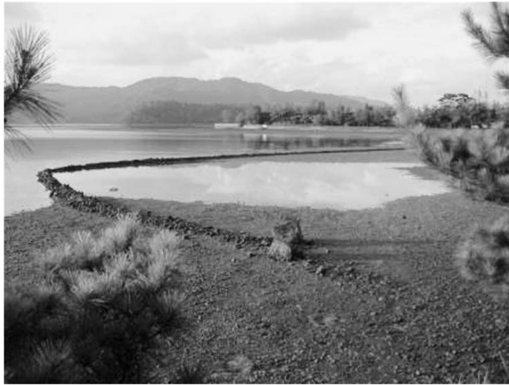
Fig. 3. Sedome gakki in Amami Oshima