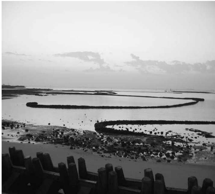
Fig. 2. Chioh-ho in Jibei, Penghu Archipelago, Taiwan

Penghu Archipelago in Taiwan has the highest concentration of stone tidal weirs in the world (ZAYAS 2008b; Fig. 2). Located in the middle of the Taiwan Straits, its environment is most suitable for attracting fish. On its northern part is the island of Jibei, said to have 100 stone tidal weirs with names, thus earning for it the nickname "stone tidal weir village."