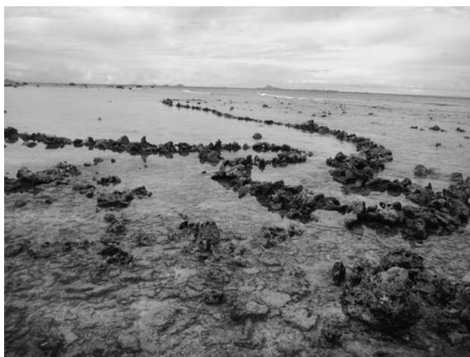
Fig. 2 Fish trap by stone fence.

[Fishing ground] Islands lying to the eastern side of Piis are superb fishing ground. Especially between Pisemweu and Onafit is perfect for hurling fish. They were fishing