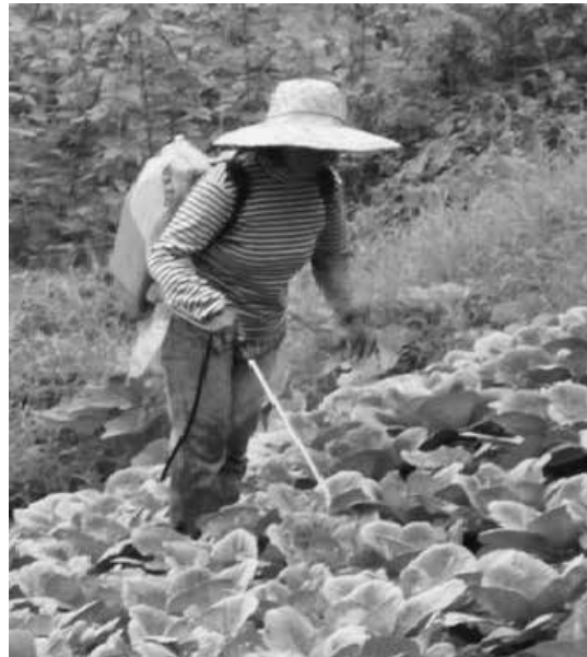
Fig. 2. A farmer spraying a cocktail pesticide to cabbage plants with improper protective clothing.

The farmers did not experience any pesticide residue monitoring with their environmental samples, except from this study. While, the researchers experienced that pesticide residue analysis