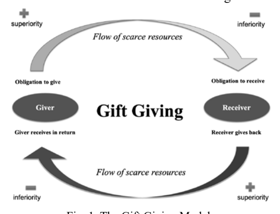
Fig. 1. The Gift Giving Model.

It is implied that the obligation to give is uniform with the obligation to receive and refusing a gift is "losing one's name" or admitting "oneself beaten in advance" (MAUSS and HALL 1990: 52). Discussing the commitment of giving, F. Nietsche (1976) through the spoken Zarathustra affirms that the "gift-giving virtue is the highest virtue" (Nietsche 1976: 186). The same author brought out the concept of pitying , and his disciples were warned that "great indebtedness does not make men grateful, but vengeful; and if a little charity is not forgotten, it turns into a gnawing worm" (Nietsche 1976: 201). Schrift (1997) agreed further, stating that an "unreciprocated gift left the receiver feeling inferior and vengeful at the intrusion on one's independence and the incursion of this debt to repay" (Schrift 1997: 3). Fig. 1 below illustrates the characteristics of the Gift Giving model.