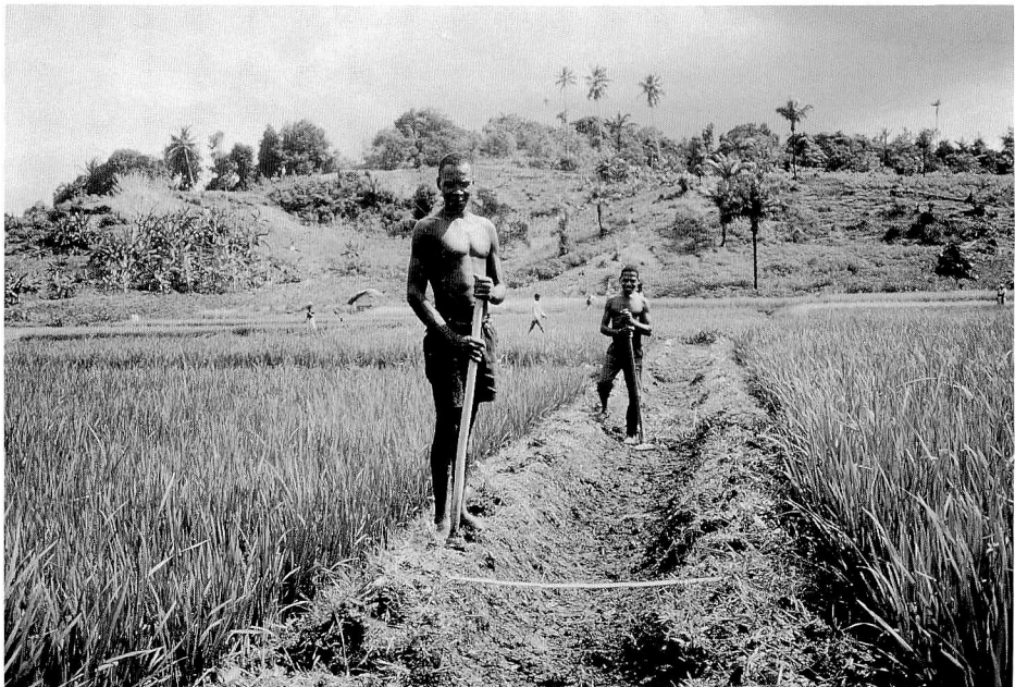
Fig. 19. Paddy field and irrigation canal. Scale shows 1 m. Kibirinzi, Pemba, TANZANIA. August 4.