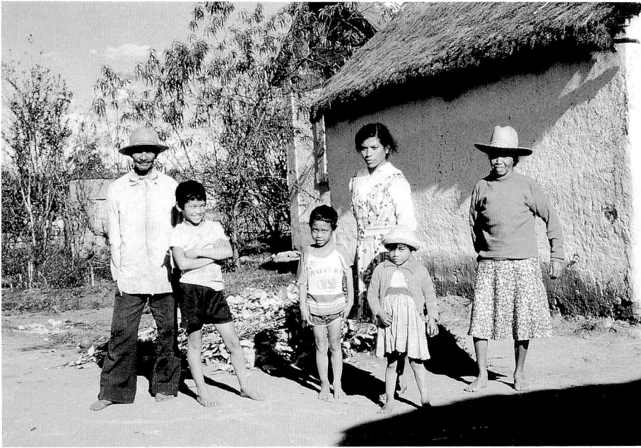
Fig. 28. People migrated from Indonesia, Ambatorapy, MADAGASCAR. June 22.