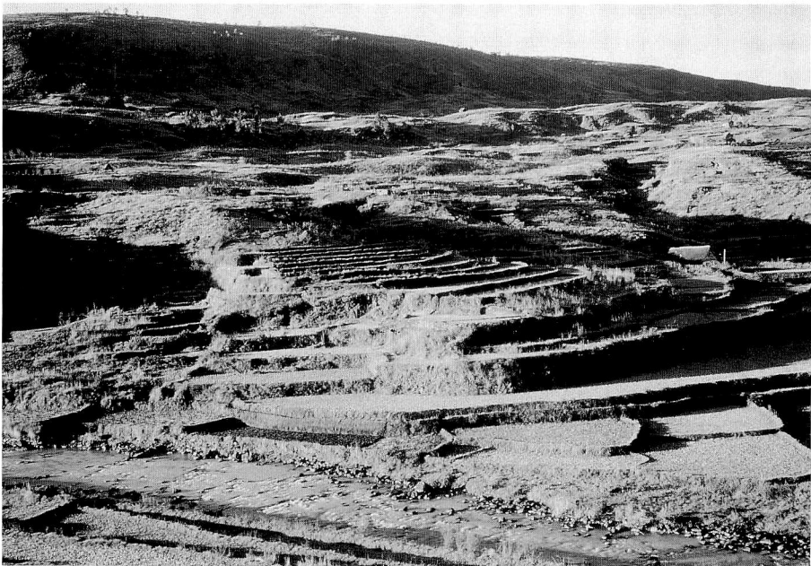
Fig. 11. Rice terraces, Antsirabe, MADAGASCAR. June 22.