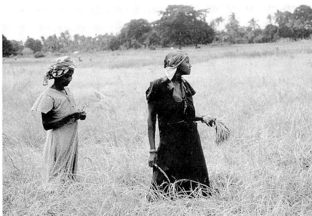
Fig. 9. Harvesting paddy by hand. Ole, Pemba, TANZANIA. August 4.