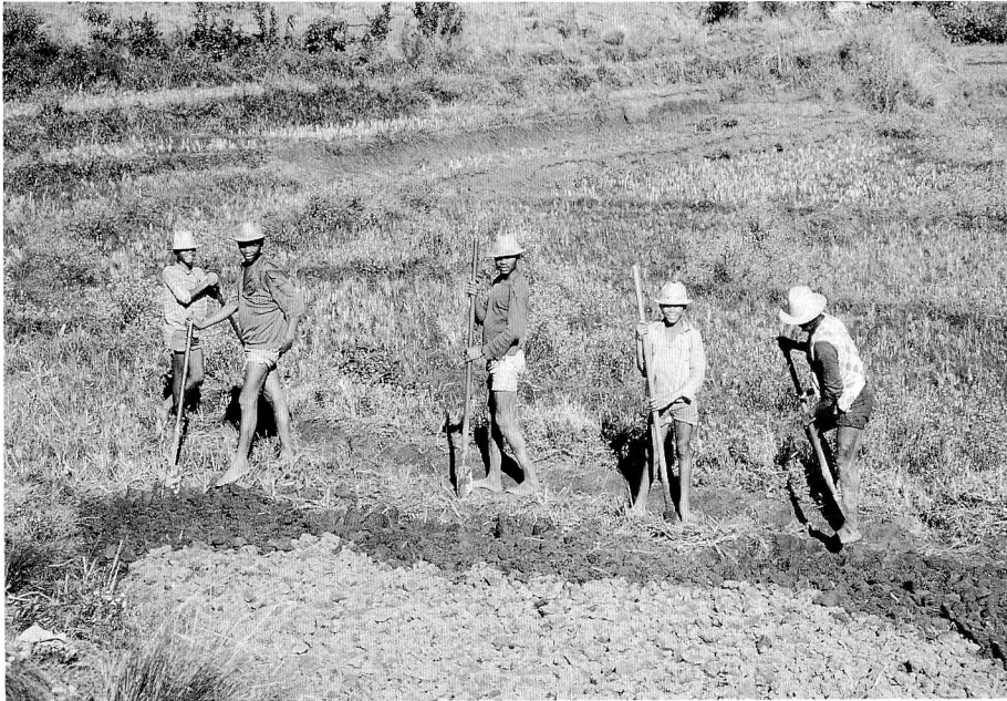
Fig. 20. Plowing terraces, Ambositra, MADAGASCAR. June 23.