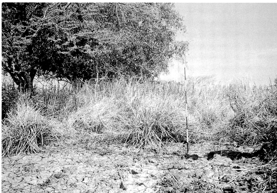
Fig. 2. Oryza punctata KOTSCHY (strain No.W85), Bahi Swamp, Dodoma, TANZANIA. July 13.