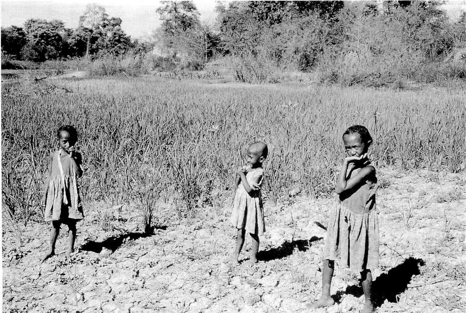
Fig. 18. Paddy field in slope area, edge of pond. Between Mampikony and Port Berge, MADAGASCAR. June 9.