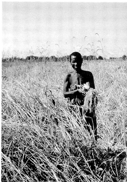
Fig. 7. Sporadic growing of O. punctata (W50) and harvesting O. sativa . Ifakara, TANZANIA. July 5.