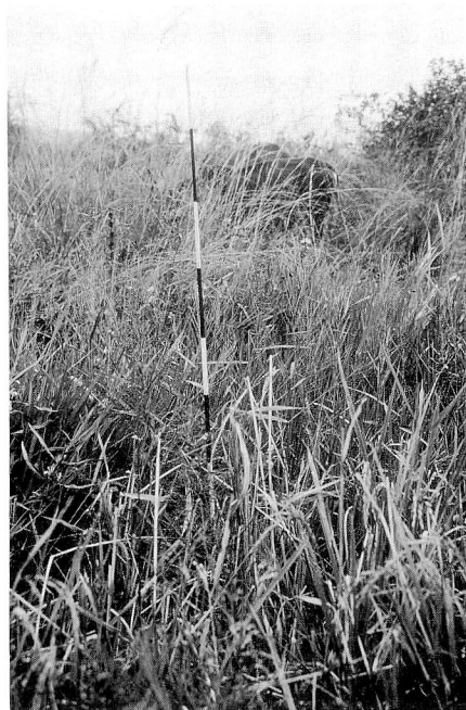
Fig. 4. O. longistaminata (W70), Kakurgusi, Sengerema, TANZANIA. July 22.