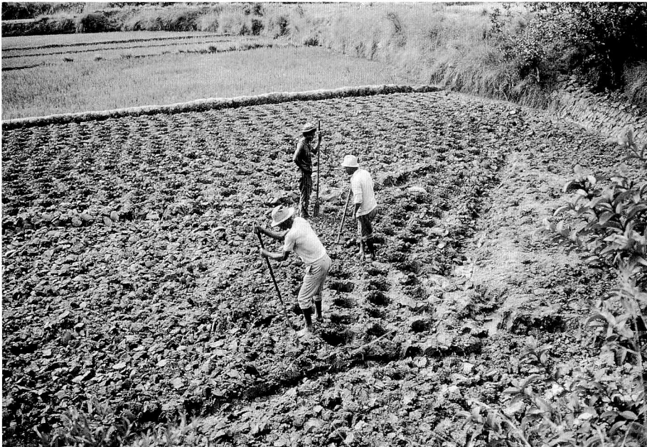
Fig. 21. Plowing for potato planting, Ambalavo, MADAGASCAR. June 22.