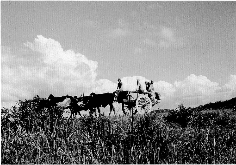
Fig. 34. Oxcart carrying paddy, Vohitraivo, MADAGASCAR. June 14.