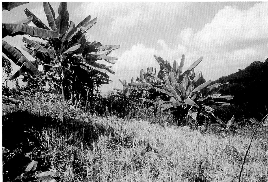
Fig. 15. Mountain area showing mixed cropping upland rice, banana and beans, Mafiga, Kyela, TANZANIA. July 8.