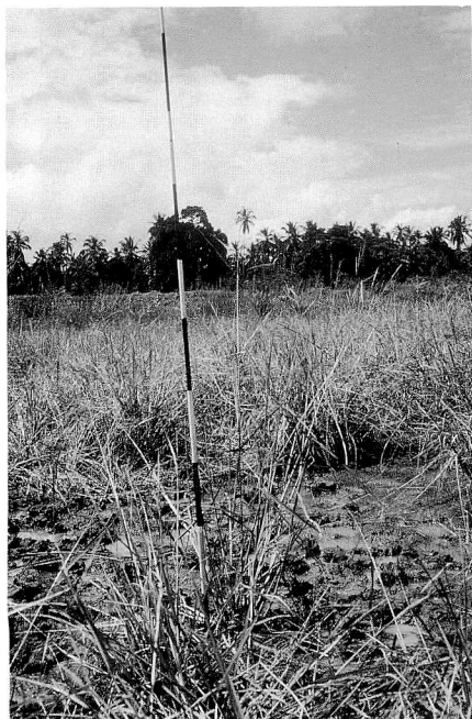
Fig. 3. O. longistaminata (W77), Mtwango, Zanzibar, TANZANIA. August 1.