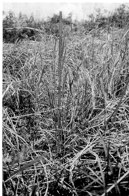
Fig. 5. O. punctata (W108) and shallow water variety of O. sativa (C204). NAFCO, Ruvu, TANZANIA. August 5.