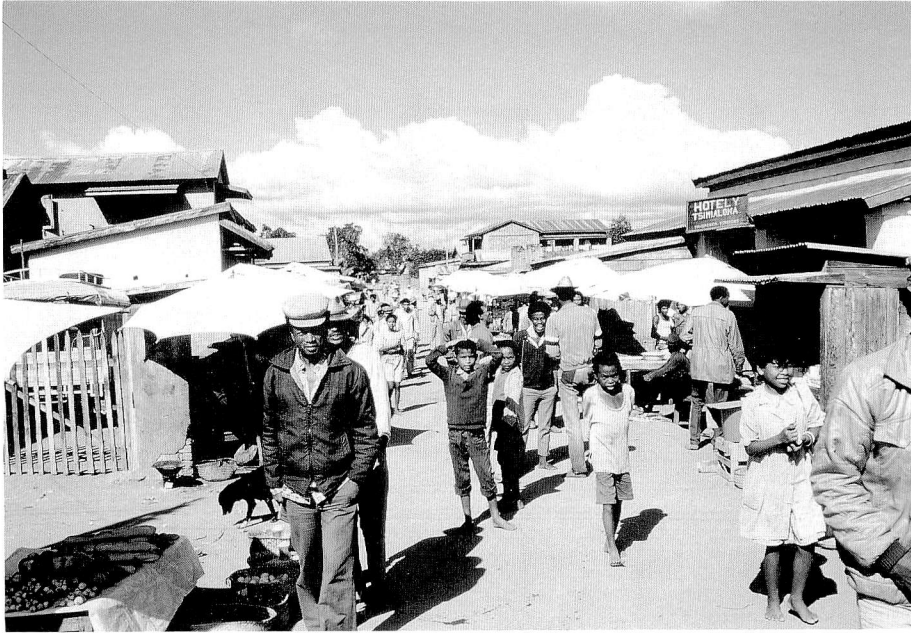
Fig. 32. Market, Tanambe, MADAGASCAR. June 14.