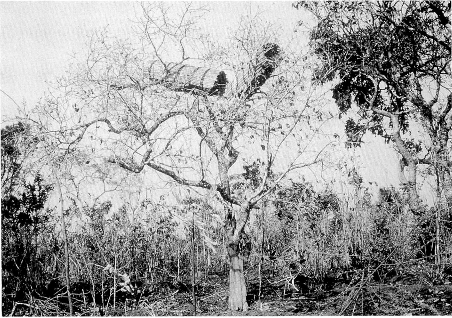
Fig. 30. Beehive of apiculture on the tree, Kasulu, TANZANIA. July 20.