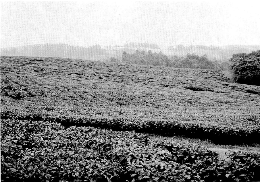
Fig. 24. Tea plantation, Tukuyu, Mbeya, TANZANIA. July 8.