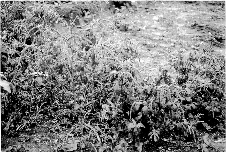
Fig. 27. Upland field showing mixed cropping tomato and Amaranthus sp., Kasole, Kibombani, Zanzibar, TANZANIA. August 2.