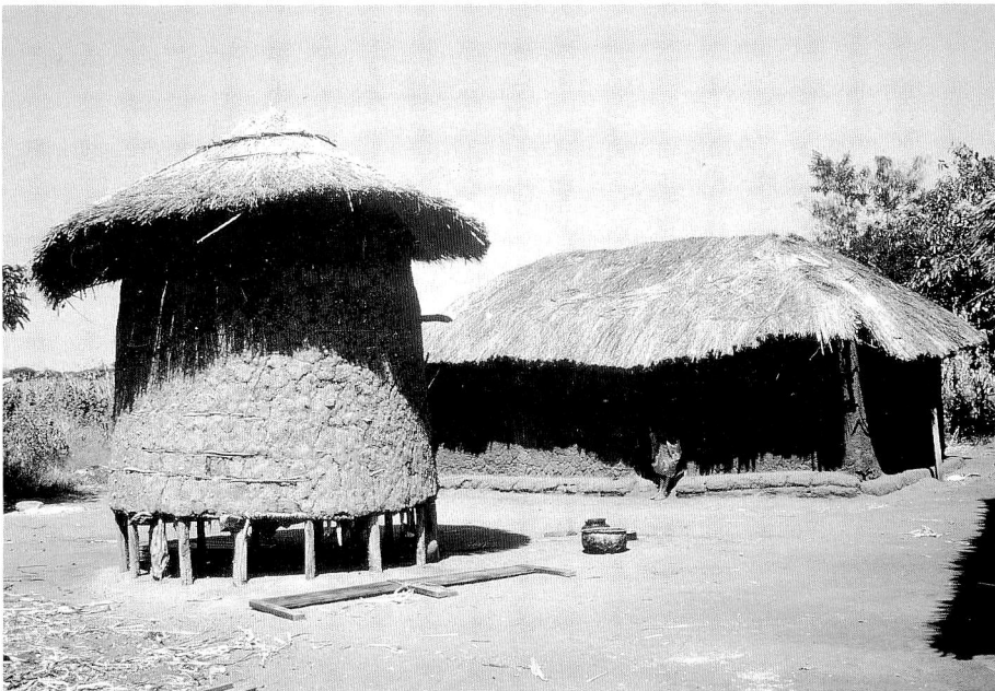
Fig. 17. Storage house of paddy, Itombara, Ivuna, TANZANIA. July 7.