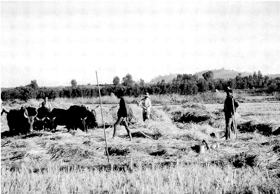
Fig. 13. Threshing paddy with cow, Ambatondrazaka, MADAGASCAR. June 14.