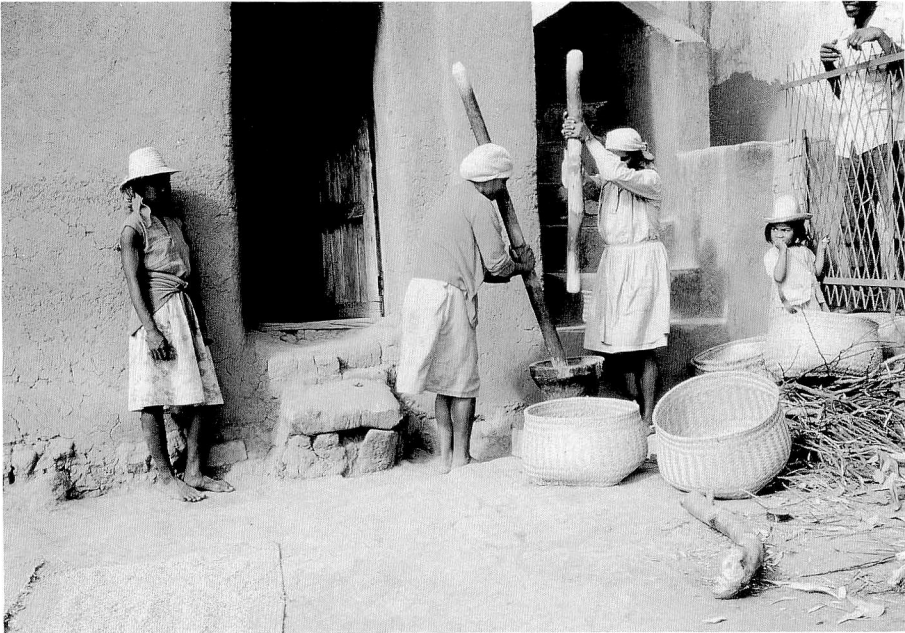
Fig. 22. Hulling in mortar, Ambalavo, Antananarivo, MADAGASCAR. June 22.