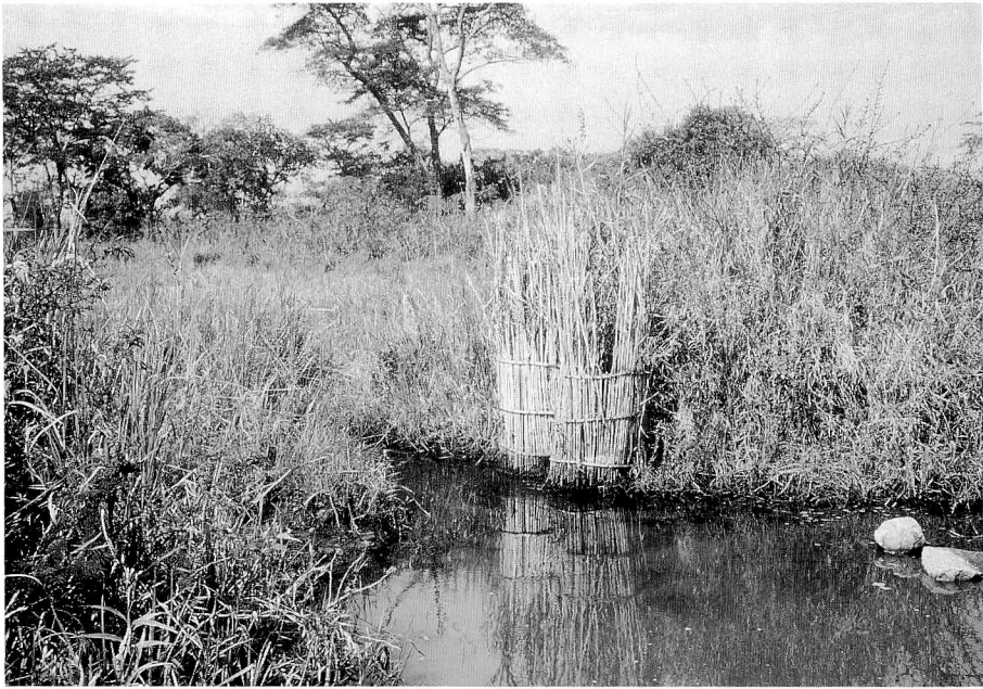
Fig. 10. O. longistaminata and fishing tool, Mhaluzi, Sengerema, TANZANIA. July 22.