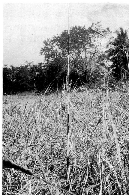
Fig. 6. O. punctata (W96) and O. glaberrima (C206), Kilombero, Zanzibar, TANZANIA. August 1.