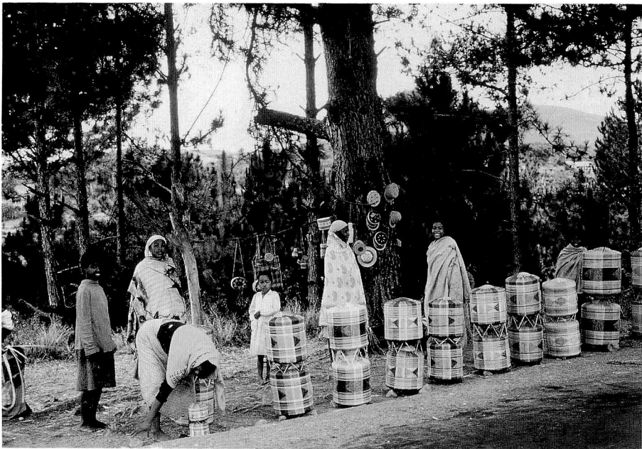
Fig. 35. Shop of article made by leaves of Raphia palm on an avenue of pines, Ambositra, Antsirabe, MADAGASCAR. June 24.