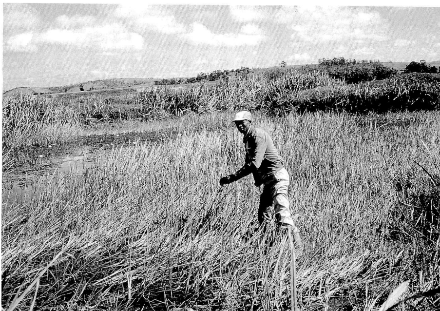
Fig. 1. Oryza longistaminata CHEV. et ROEHR. (strain No.W35), Ambahitarivo, MADAGASCAR. June 14.