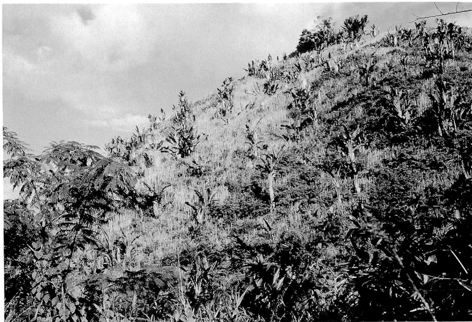
Fig. 14. Mixed cropping of upland rice and banana in mountain slope, Brickaville, MADAGASCAR. June 17.