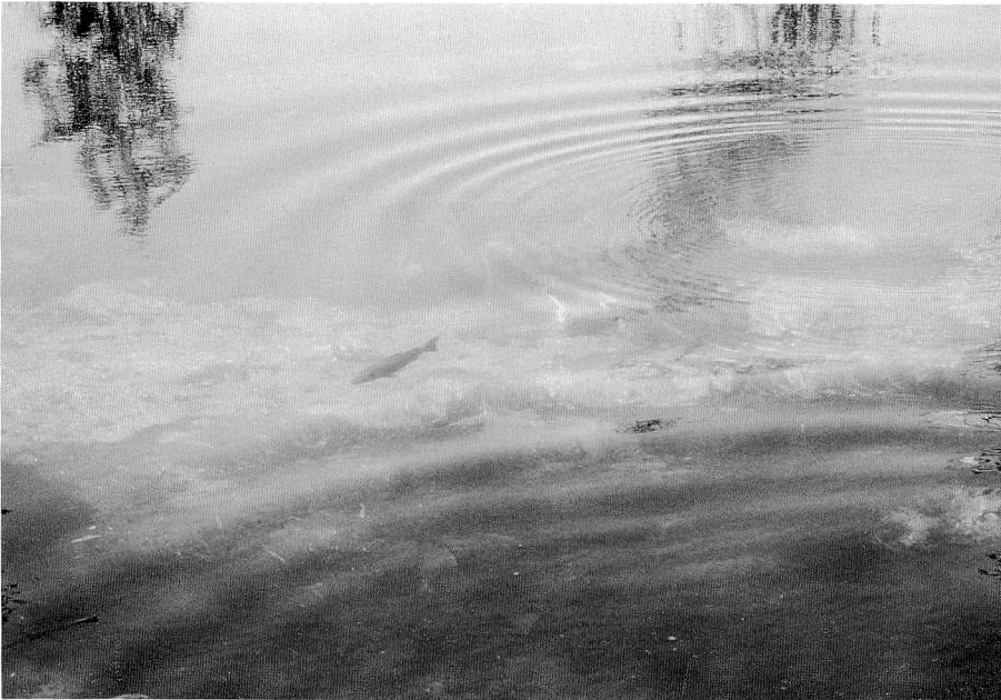
Fig. 31. Fish culture in pond, lac Sacre, Mahajanga, MADAGASCAR. June 4.