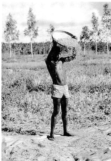
Fig. 8. Winnowing rice, Bumbwi, Zanzibar, TANZANIA. August 1.