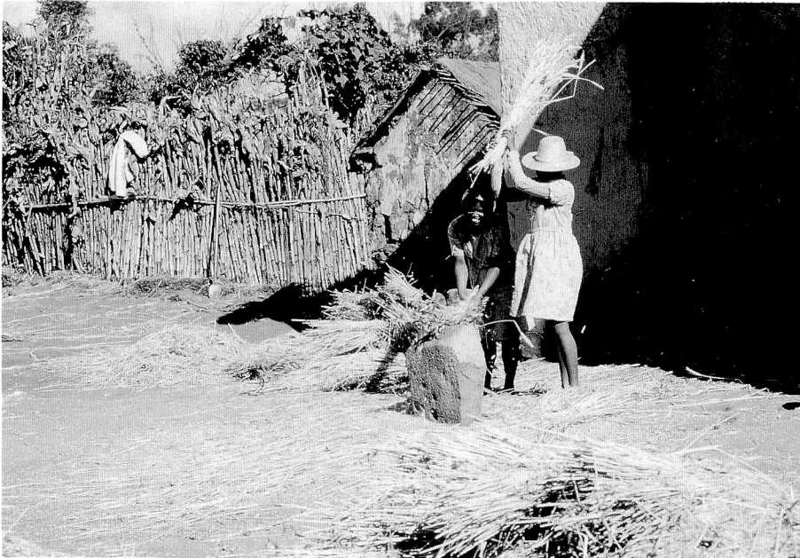
Fig. 23. Threshing wheat with stone, near lac Tritriva, Antsirabe, MADAGASCAR. June 23.