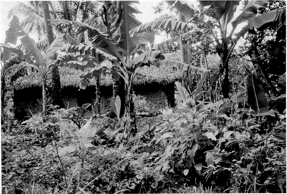
Fig. 26. O. punctata and home garden, 24 km north from Zanzibar City, TANZANIA. August 2.