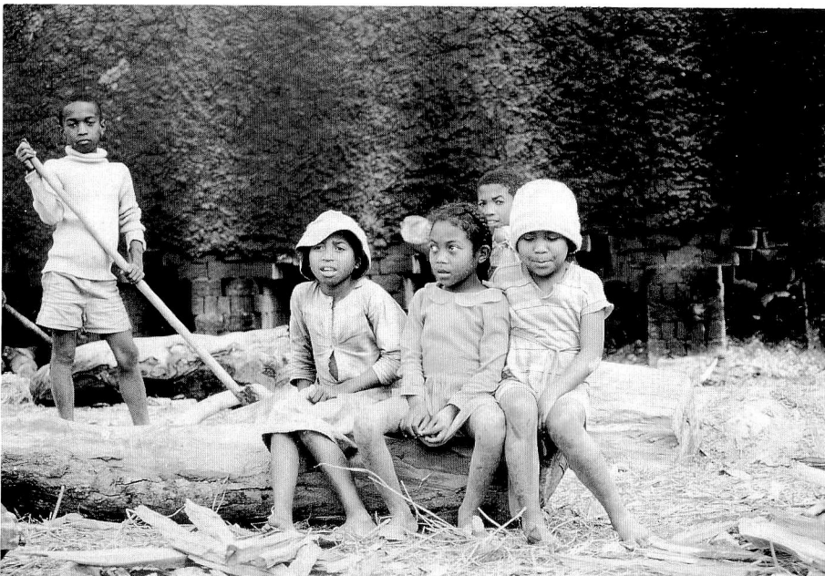
Fig. 29. Children front of bricks making, Ambositra, Antsirabe, MADAGASCAR. June 23.