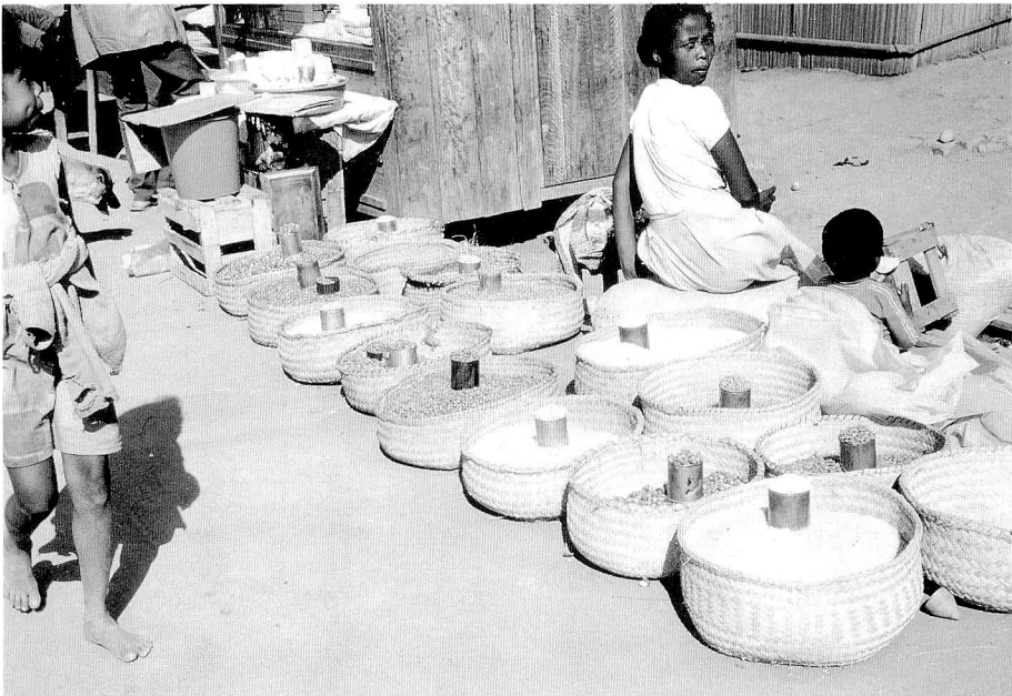
Fig. 33. Market, Tanambe, MADAGASCAR. June 14.