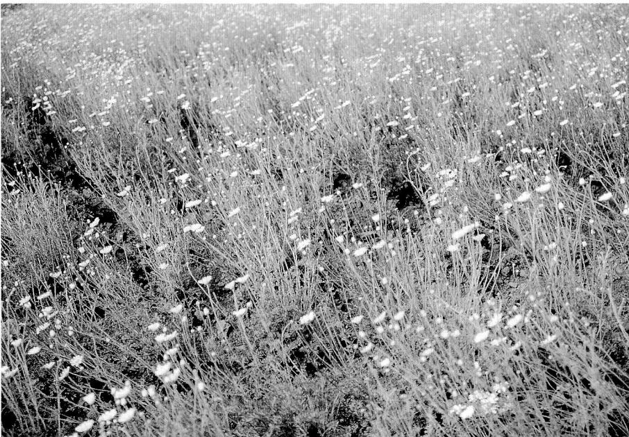
Fig. 25. Phyrethrum plantation, Mbeya, TANZANIA. July 8.