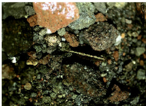
Fig. 2. Dorsal view of Caridina typus collected in Takeshima.