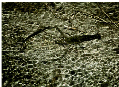
Fig. 3. Dorsal view of Macrobrachium lar collected in Takeshima.