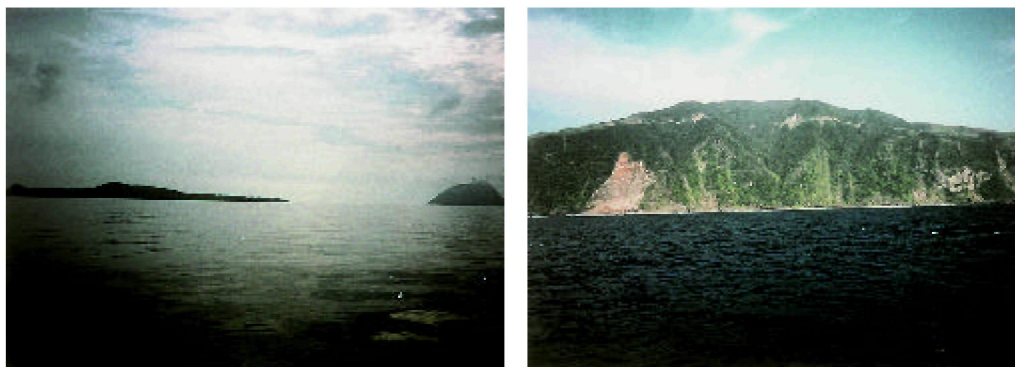
Fig. 5. Distant view of Takeshima, Ioujima, and Kuroshima. Left; Takeshima (left side) and Ioujima (right side), Right; Kuroshima.

to 1.0 Ma and 0.2 to 0.02 Ma. He mentioned that there was a deep channel at the Kerama and Tokara gaps. Based on the depths around the Mishima Islands, there is no possibility that Takeshima and Kuroshima were connected to the Kyushu Island about 0.2 to 0.02 Ma and, in that period, G. dehaani immigrated into the two islands. The maximum altitudes of Takeshima, Kuroshima (Fig. 5), Kuchierabujima, and Yakushima are 194 m, 622 m, 657 m and 1935 m, respectively. Takeshima and Kuroshima were connected to the Chinese mainland about 1.0 Ma, but thereafter only Takeshima was submerged by sea-level rising and was never connected with Kyushu.