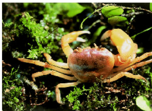
Fig. 4. Dorsal view of Geothelphusa dehaani collected in Kuroshima.

Geothelphusa dehaani (Fig. 4) is a true freshwater crab, which was found in Kuroshima but not in Takeshima. Since G. dehaani also inhabits the adjacent islands, such as Kuchierabujima and Yakushima (SUZUKI & TSUDA, 1991; SUZUKI & SATO, 1994), it suggests that this crab might have occurred in Takeshima about 1.0 Ma when the island was connected to the Chinese mainland.