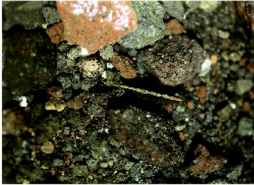
Fig. 2. Dorsal view of Caridina typus collected in Takeshima.