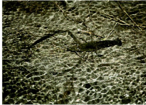
Fig. 3. Dorsal view of Macrobrachium lar collected in Takeshima.