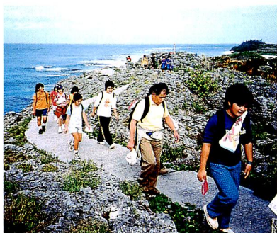
Yoron Panauru Walk