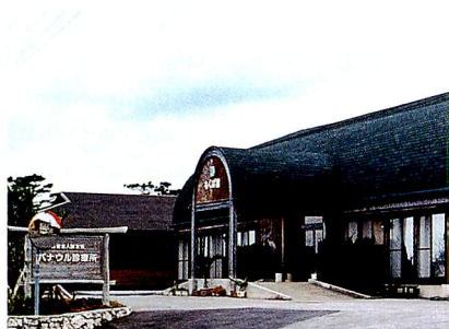
Panauru Clinic, where the office for Yoron Health Villa is located

Based on the 4th Ten Year Plan of Yoron, which I outlined earlier, I would like to introduce the future prospects for here on as part of Yoron's plans for the