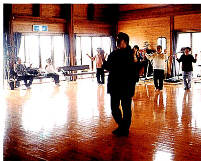
Health exercise room inside Panauru Clinic