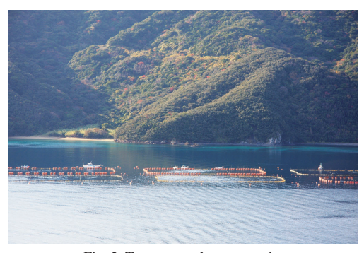
Fig. 2. Tuna aquaculture grounds.

At present, company "A" engages in tuna aquaculture in Urauchi Bay and the Kuratsuma waters; however the waters of Urauchi Bay are the primary area of production. 18 large fish preserves of 70 m x 40 m have been installed in the waters of Urauchi Bay (Fig. 2). Approximately 30 people are employed in this project, of which 27 are from the Koshiki Islands (Fig. 3). Many of these workers are aged in their 20s and 30s. This is because company "A" gave word to the FCA that they would provide preferential employment opportunities to local residents when they started this project, and parents, upon hearing of this news, summoned their sons back to the island. Although workers begin early in the morning, their finishing time is also early. Multiple young people in their 20s and 30s